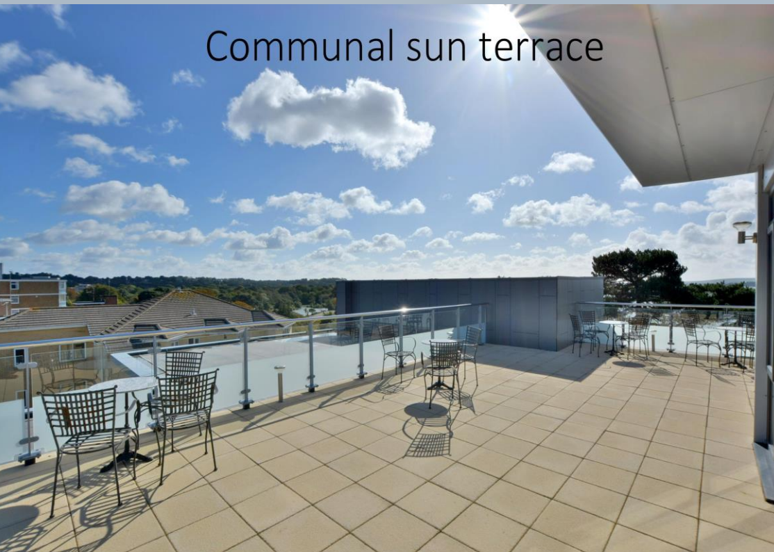
Communal sun terrace