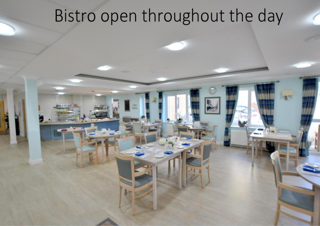
Bistro open throughout the day