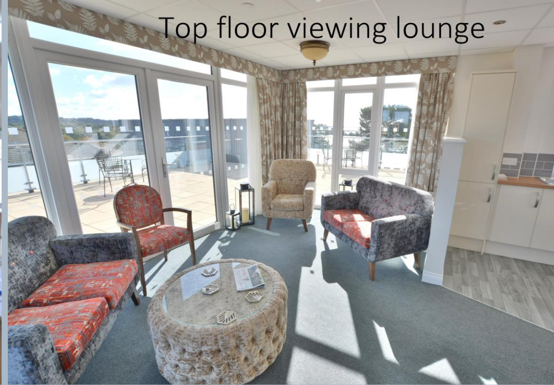
Top floor viewing lounge