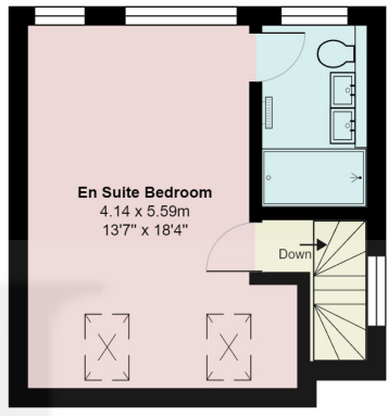
Second Floor Area: 28.7 m 2 ... 309 ft 2