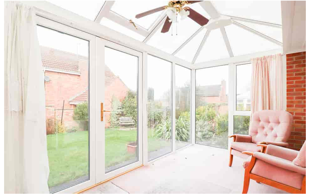
Dene Close, Wellingborough, Northamptonshire NN8 5QP Offers Over £300,000 - Freehold