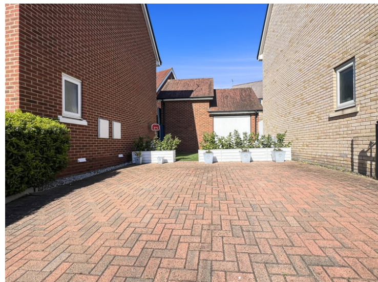
Landscaped Front Garden