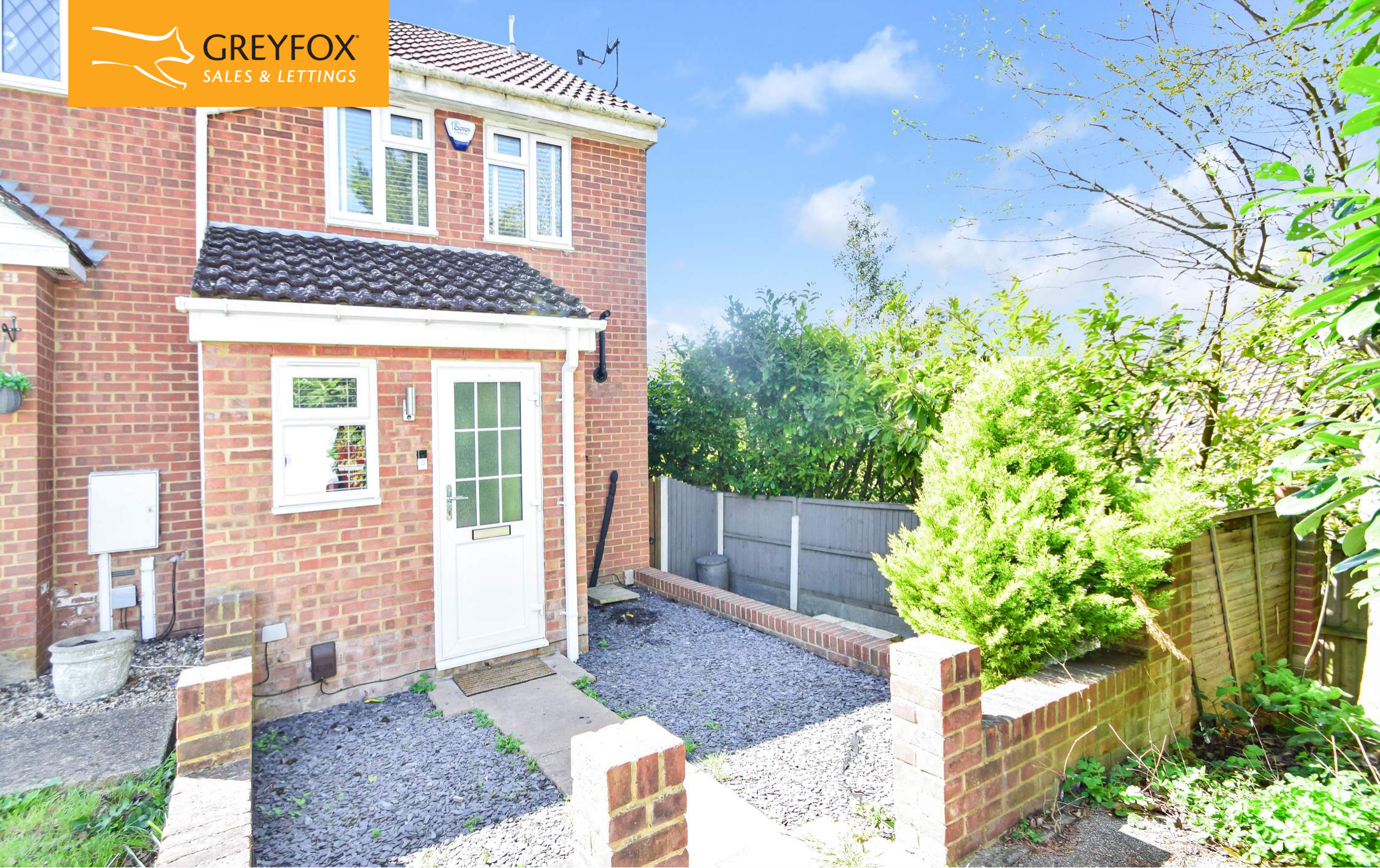
Two Bedroom Semi-Detached House Wedgewood Drive, Chatham, Kent, ME5 0LD