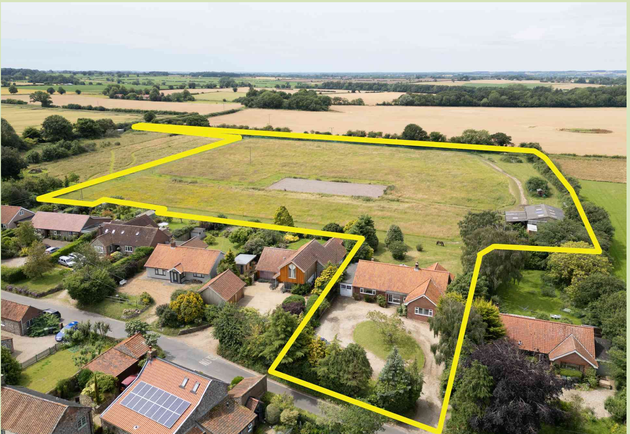
Barn End, Bale Offers in excess of £700,000