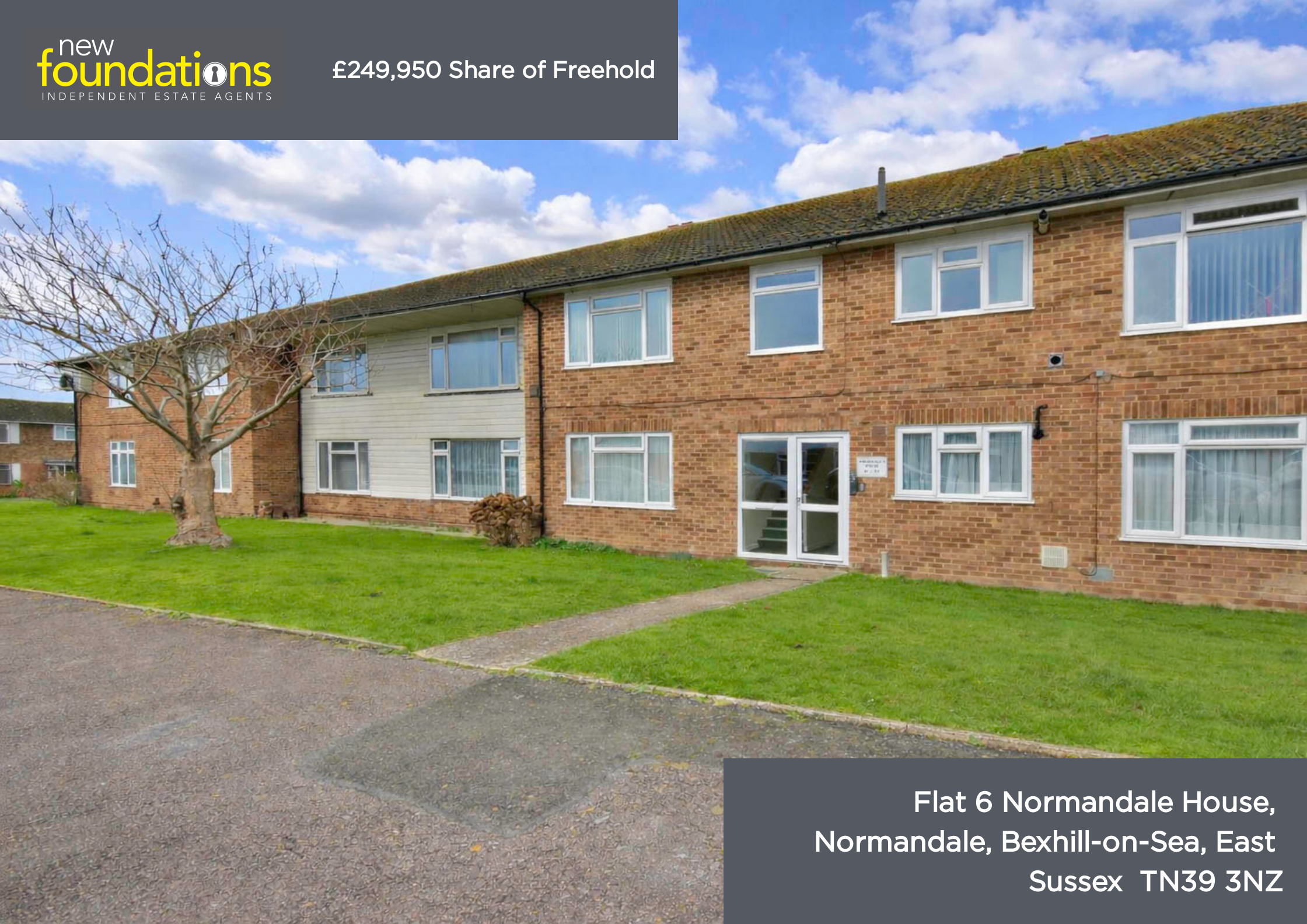
Flat 6 Normandale House, Normandale, Bexhill-on-Sea, East Sussex TN39 3NZ