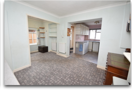
127 Badshot Lea Road, Badshot Lea, Farnham, Surrey. GU9 9LS. Guide Price £375,000