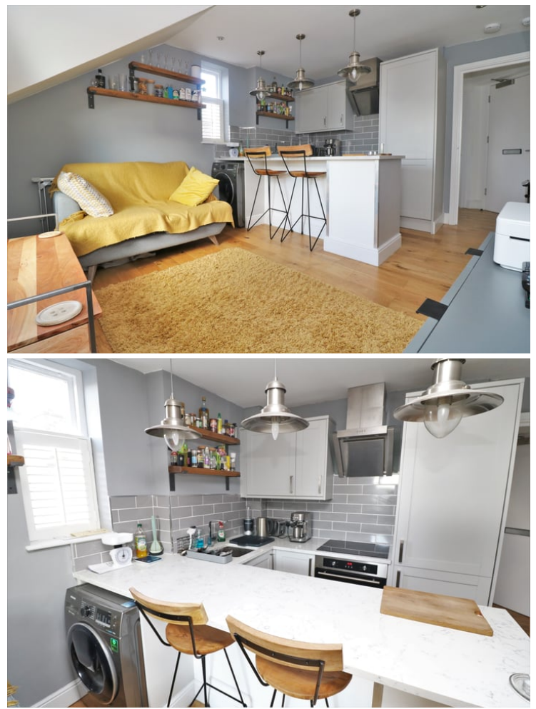
14' 1" x 11' 6" (4.29m x 3.51m) With windows to front and side with fitted café style shutters, solid oak flooring, storage heater. The kitchen area comprises of a range of fitted units and drawers with marble worktops over, inset sink, inset hob, electric oven, fitted fridge/freezer, space for washing machine, extractor, tiled splashbacks, eye level units. Prewired for ceiling speakers, satellite cables.