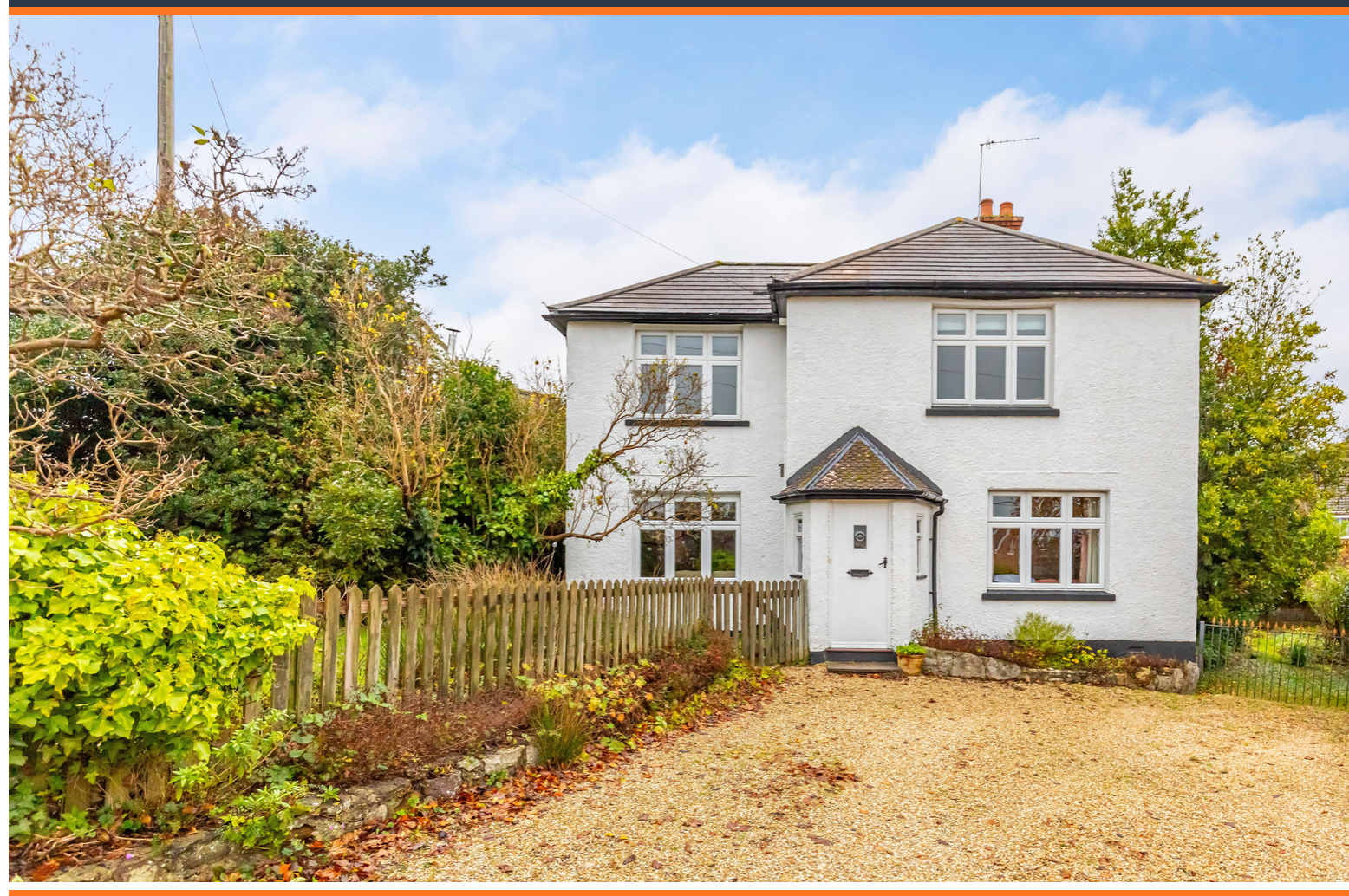
131 Middlehill Road, Wimborne, Dorset, BH21 2HL Guide Price £650,000

** CHARMING DETACHED HOME ** OVER 1,600 SQUARE FEET OF LIVING ACCOMMODATION ** Link Homes Estate Agents are delighted to present for sale this four bedroom, two bathroom detached family home situated in the much-desired Colehill location. Boasting character and benefitting from an array of standout features including four good-sized bedrooms with bedroom three offering a walk-in dressing room, two reception rooms, one of which includes a gorgeous exposed brick fireplace, a country-style kitchen leading onto the bright and airy garden room, a separate utility room with space for appliances, a stylish bathroom suite on the first floor with a separate WC, a downstairs family bathroom suite, a mature wrap-around garden and a shingle driveway with parking for multiple vehicles! This is a must-view to appreciate the accommodation and character on offer!