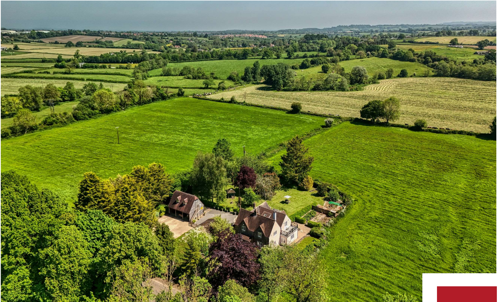
Titmarsh Farmhouse, Tytherington, BA11 5BN Guide £1,000,000 - £1,100,000 Freehold