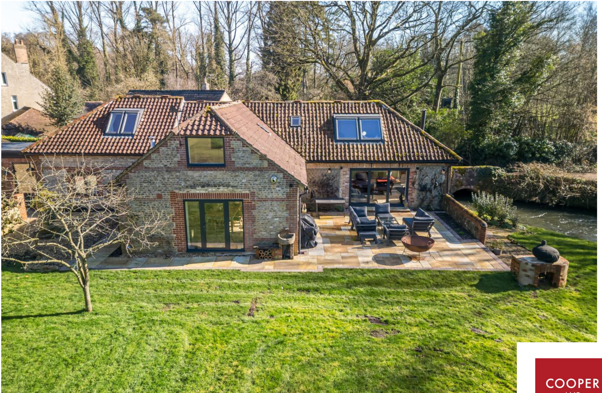
Old Mill Barn, Henford Marsh, Warminster, Wiltshire, BA12 9PA