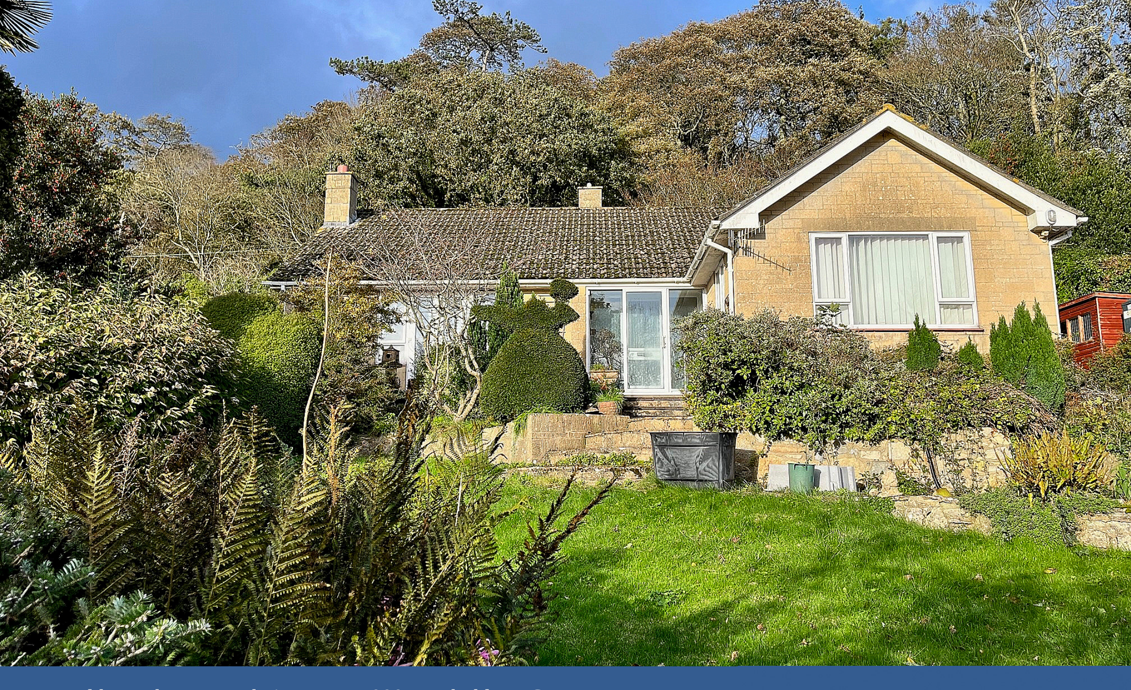
3 Bed bungalow coastal views £735,000 Freehold EPC E Underhill, Lower Catherston Road, Bridport, Dorset DT6 6LY