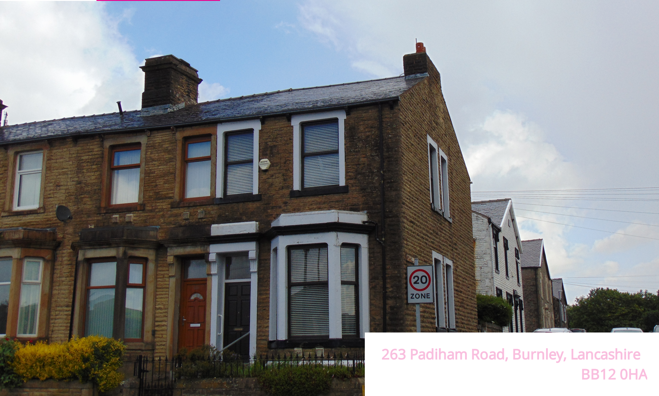
263 Padiham Road, Burnley, Lancashire BB12 0HA