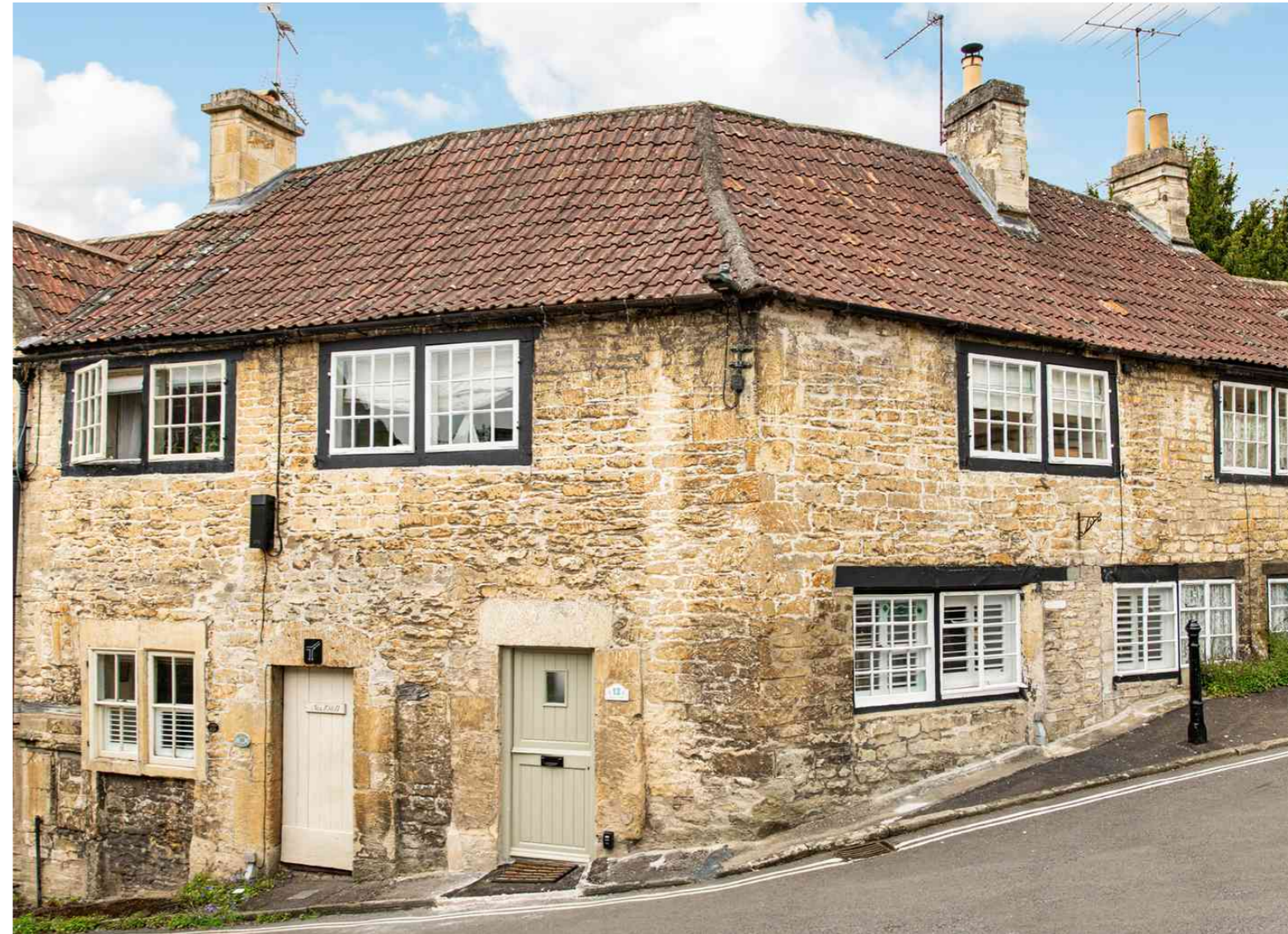
12 Coppice Hill, Bradford on Avon