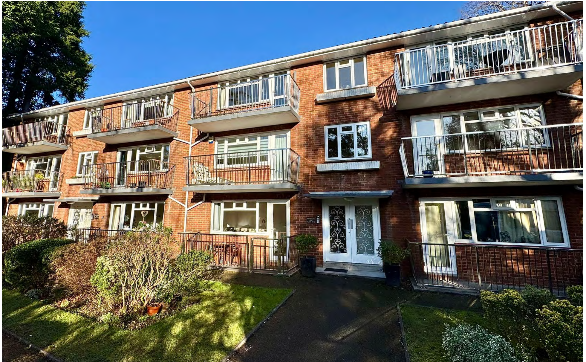
Portarlington Court, Portarlington Road, Bournemouth BH4 8BU