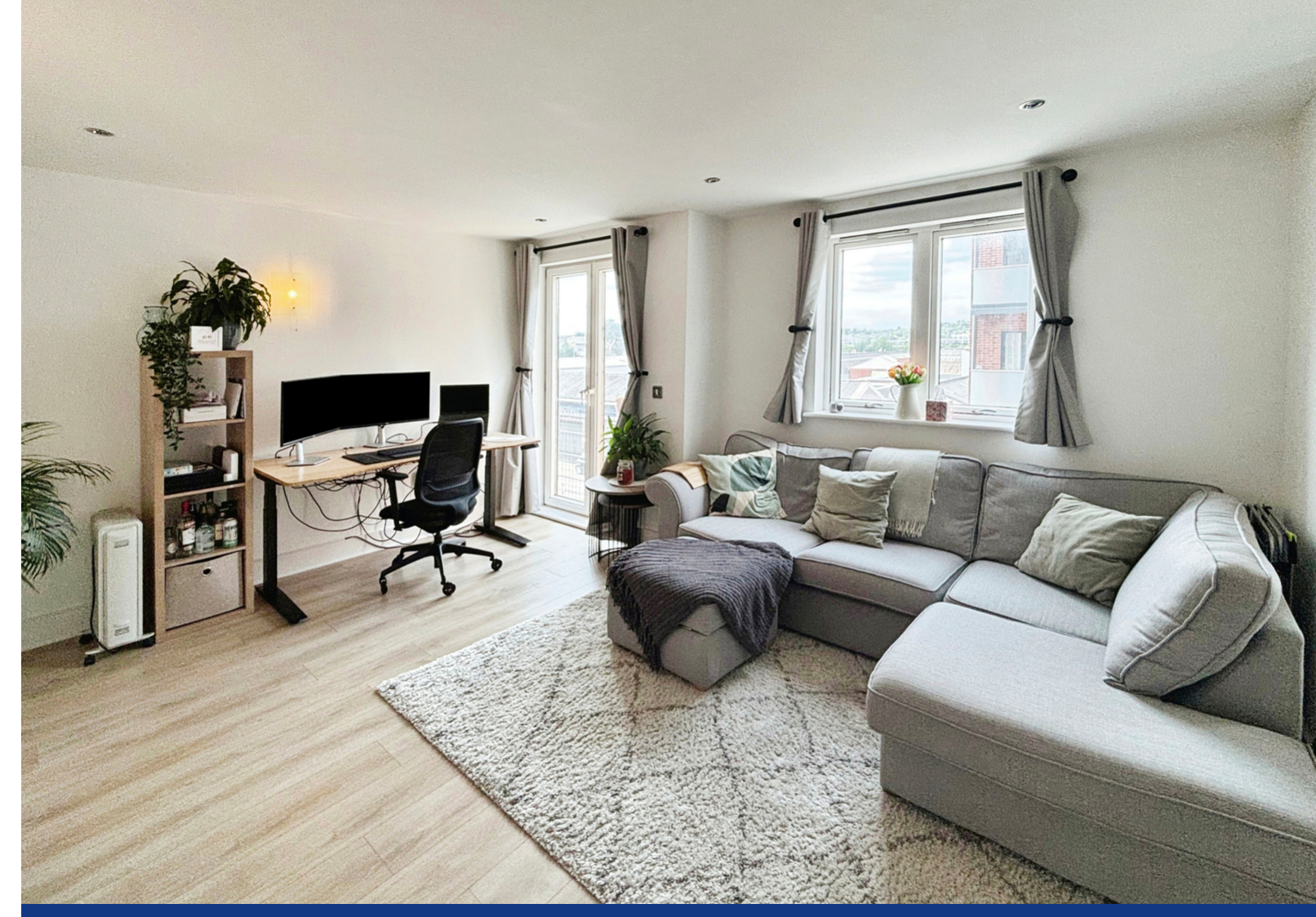
Thorn Walk, Reading, Berkshire. RG1 7BJ.