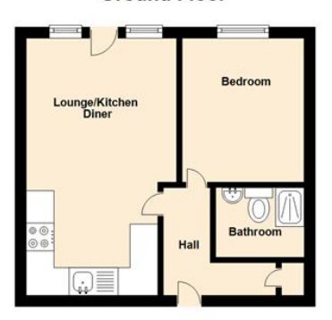
Floor plans are for layout purposes only. Measurements are approximate and subject to inaccuracies