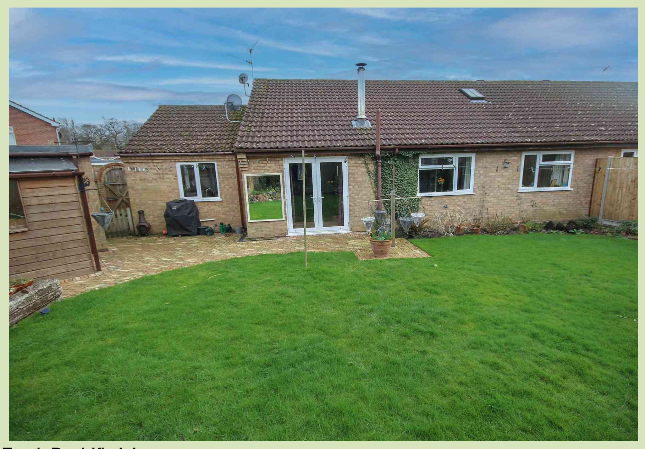
46 Temple Road, King's Lynn Guide Price £340,000