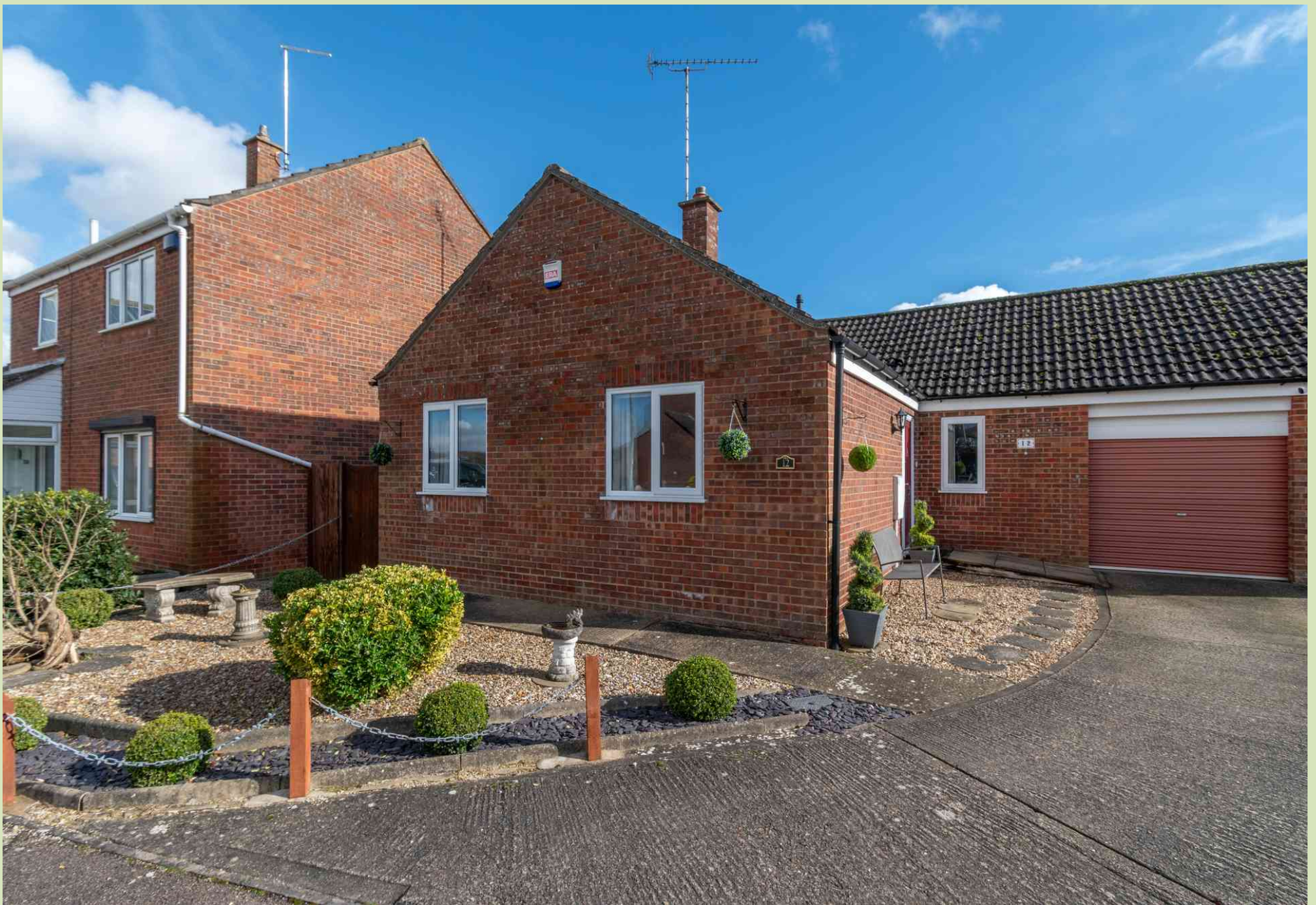
12 Searle Close, Fakenham Guide Price £290,000