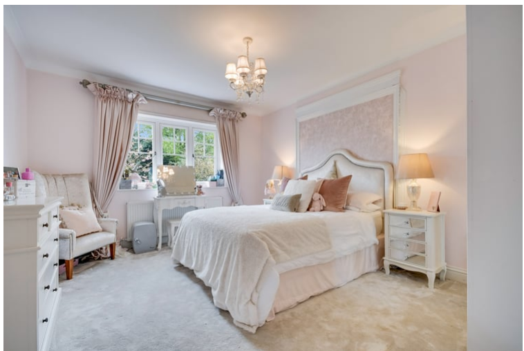
4.50m x 3.57m (14' 9" x 11' 9") Double glazed window overlooking the rear garden with radiator set beneath, cornice to the ceiling, and fitted wardrobe cupboards.

coupled WC and vanity wash hand basin with mixer tap. There is also an obscured double glazed window facing the front elevation and recessed spotlighting.