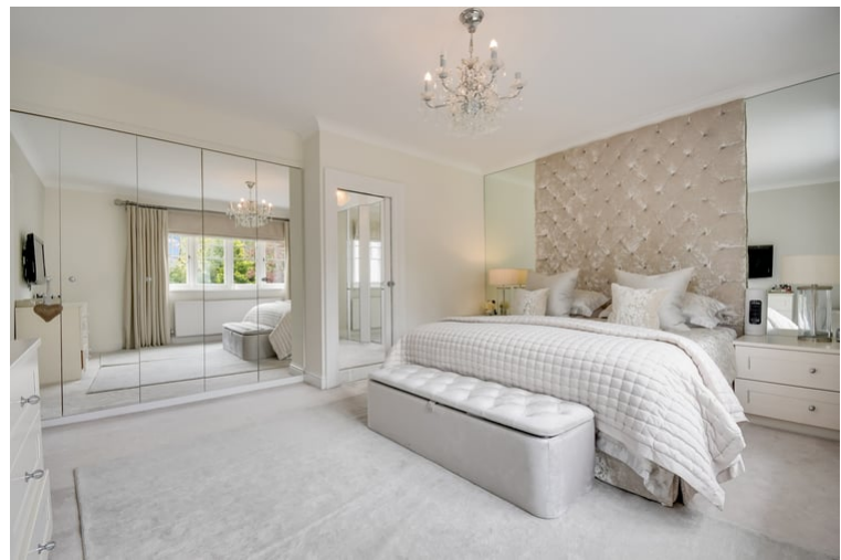
4.72m x 3.46m (15' 6" x 11' 4") Situated at the rear of the property with views over the garden via a double glazed window this spacious master bedroom has fitted wardrobes and a door leading to;