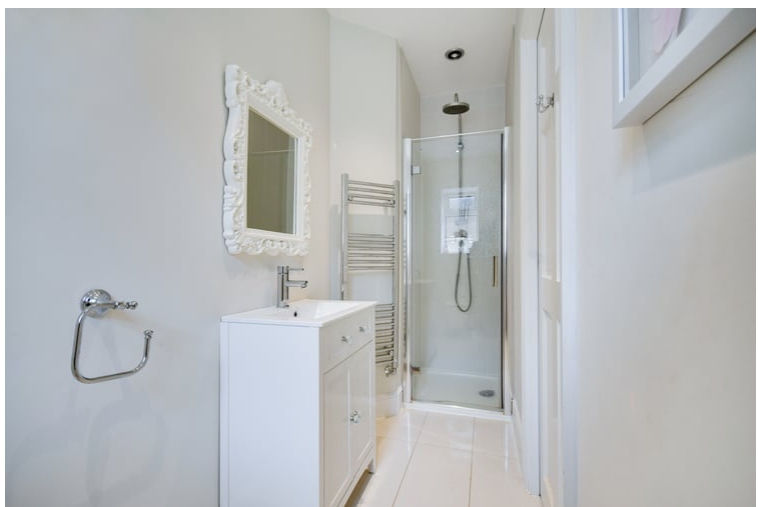
This comprises of a concealed cistern WC, a vanity wash hand basin with mixer tap, walk-in shower enclosure with glazed screen, overhead rainfall shower and separate handheld shower attachment, extractor fan and recessed spotlighting.