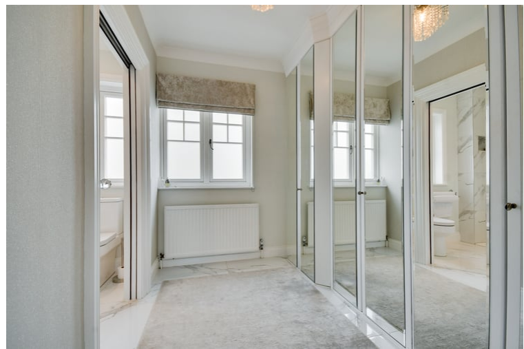
2.85m x 1.77m (9' 4" x 5' 10") Fitted with floor to ceiling wardrobe cupboards with mirrored fronts, natural light provided by a double glazed window facing the front with a radiator set beneath, and a pocket door opens onto: