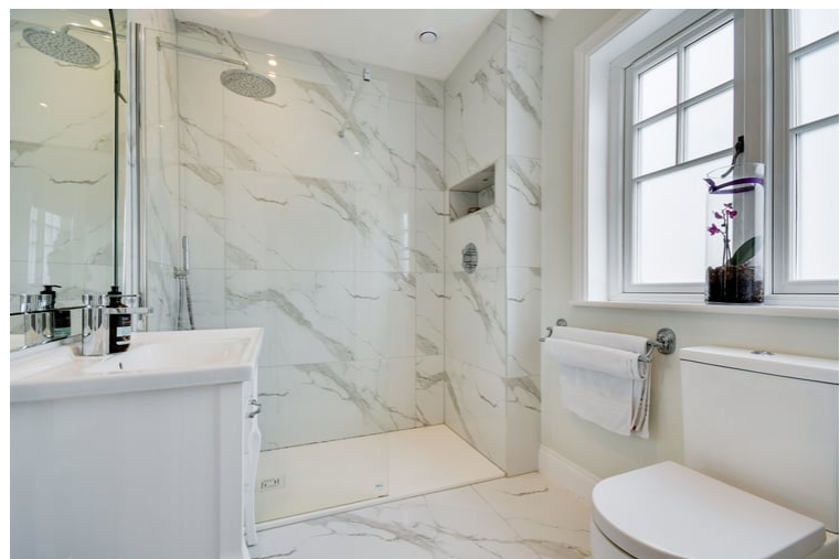
A large walk-in shower enclosure with frameless glazed screen, overhead rainfall style shower, separate hand held shower attachment and wall mounted temperature and pressure controls. There is a close

coupled WC and vanity wash hand basin with mixer tap. There is also an obscured double glazed window facing the front elevation and recessed spotlighting.