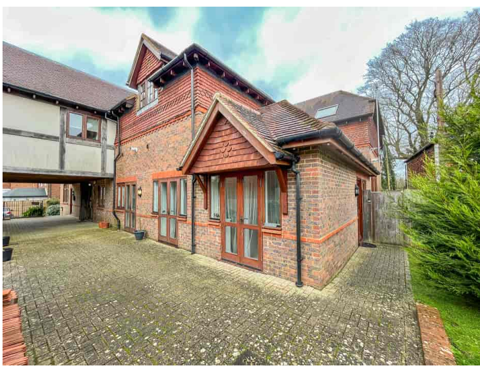
Flat 3 Colemans House 113 London Road, Hurst Green, East Sussex. TN19 7PN. £189,000 leasehold

An immaculately presented ground floor apartment with two double bedrooms, parking and in a central village location.