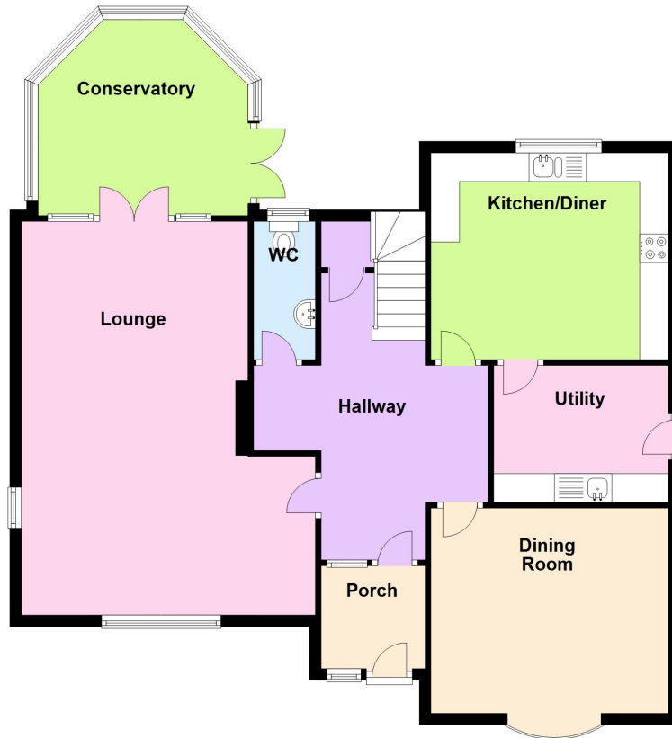
Ground Floor Approx. 103.0 sq. metres (1108.8 sq. feet)