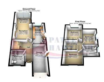
Total area: approx. 96.4 sq. metres (1037.4 sq. fe