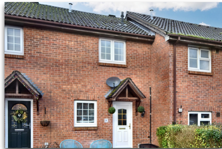
61 St Peters Gardens, Wrecclesham, Farnham, Surrey. GU10 4QY. £1,500 pcm