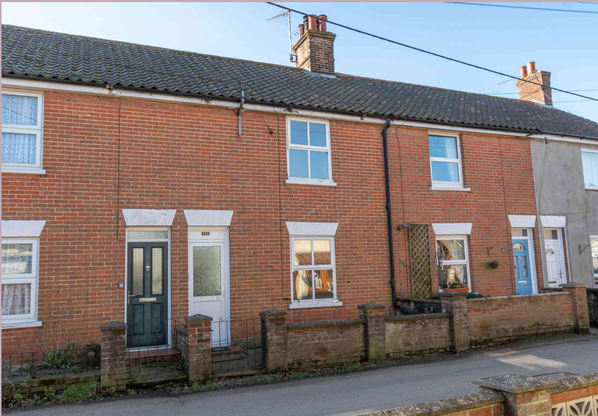
11 The Lane, Briston £1,100 per calendar month