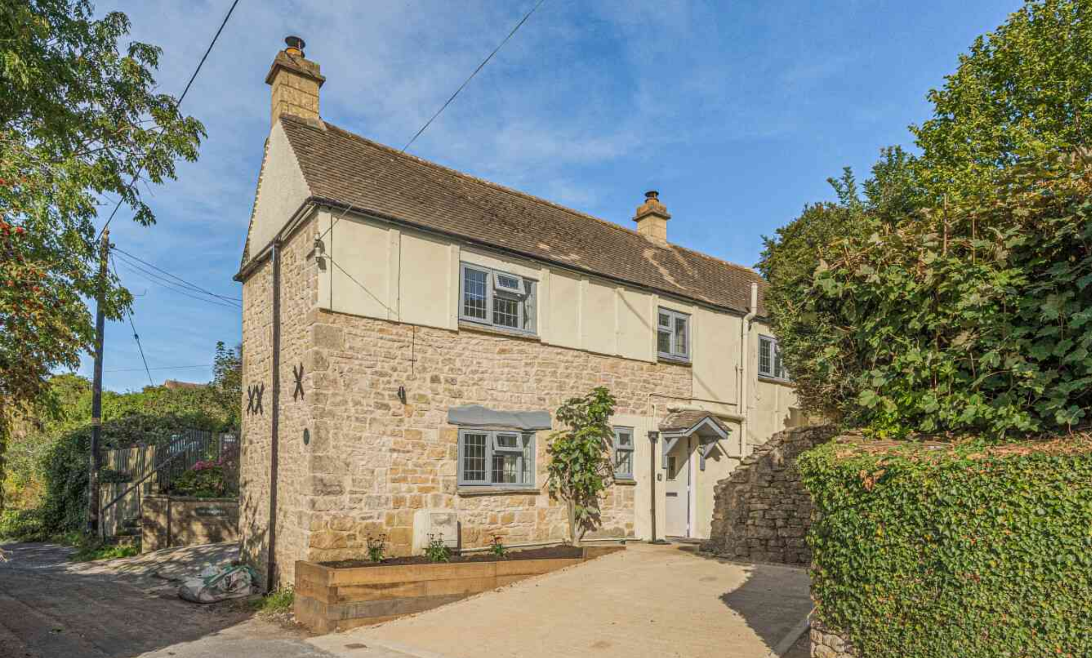
Glen Cottage Cowswell Lane, Bussage, Gloucestershire, GL6 8AU Price Guide £330,000