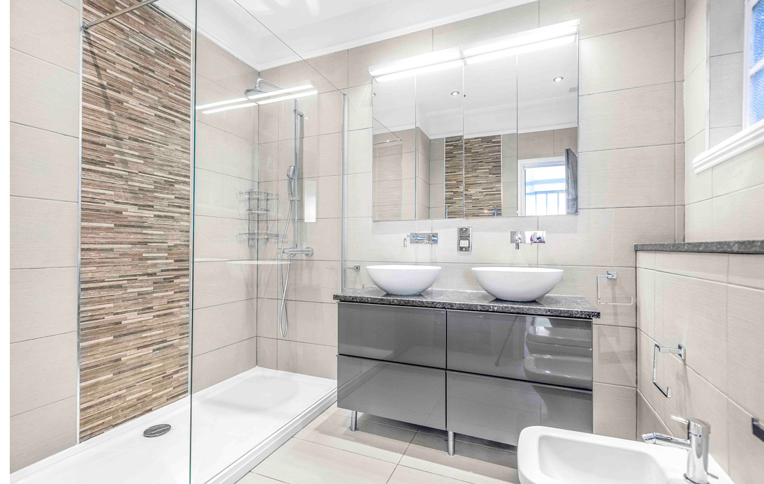
Flat 78 Bryanston Court, George Street, Marylebone, London, W1H 7HD £1,975 p/w