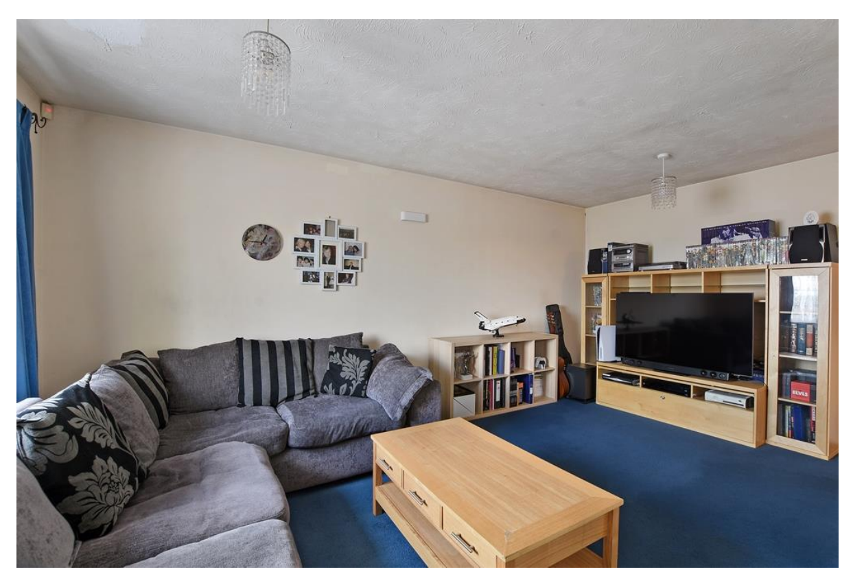
EPC Rating: C

A one bedroom third (top) floor flat located in this purpose built development constructed circa 1990's by Laing Homes