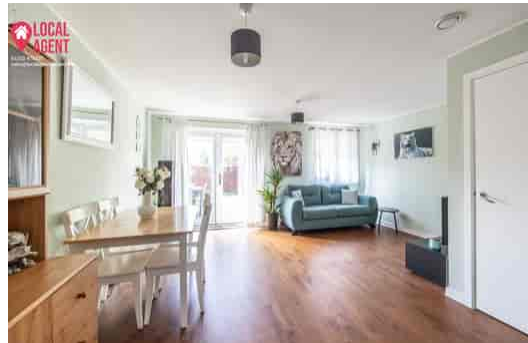
1Vimy Drive, Dartford, Kent,, , DA1 5FJ £450,000 Freehold