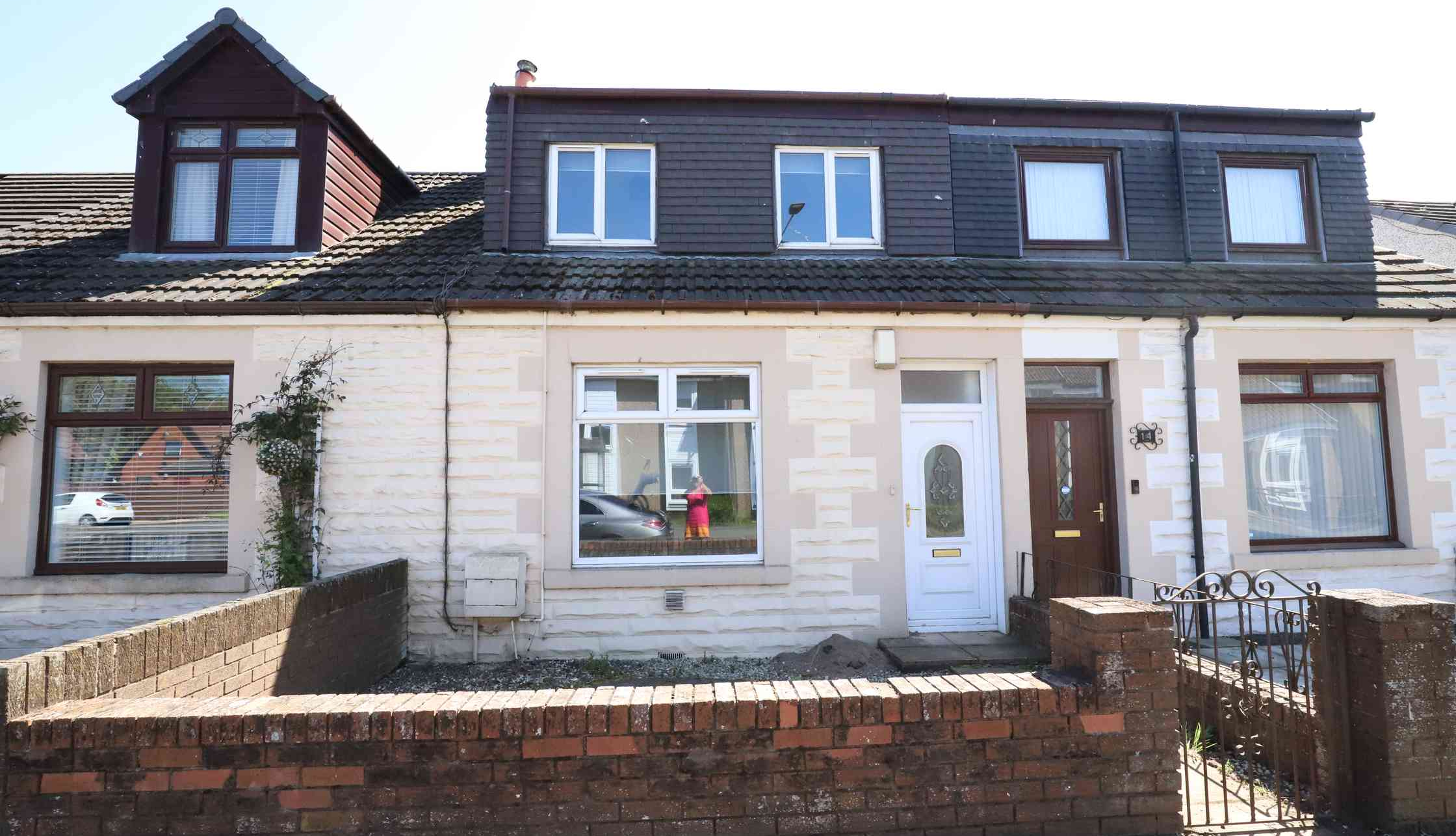
Offers Over £149,500 16 Cardenden Road, Cardenden, Lochgelly, Fife, KY5 0PA