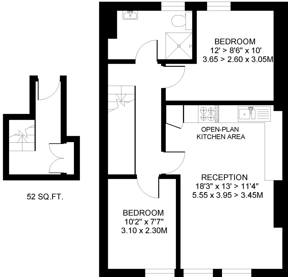
SECOND FLOOR 542 SQ.FT.

COPYRIGHT FLOORPLAN PRODUCED FOR " JOHN THOROGOOD " BY FLOORPLANNERS 07801 228850