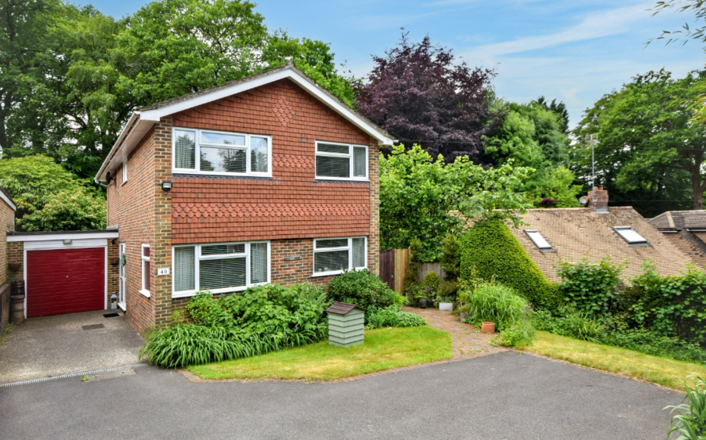
Harkwood, 40 Sandrock Hill Road, Wrecclesham, Farnham, Surrey. GU10 4RJ.