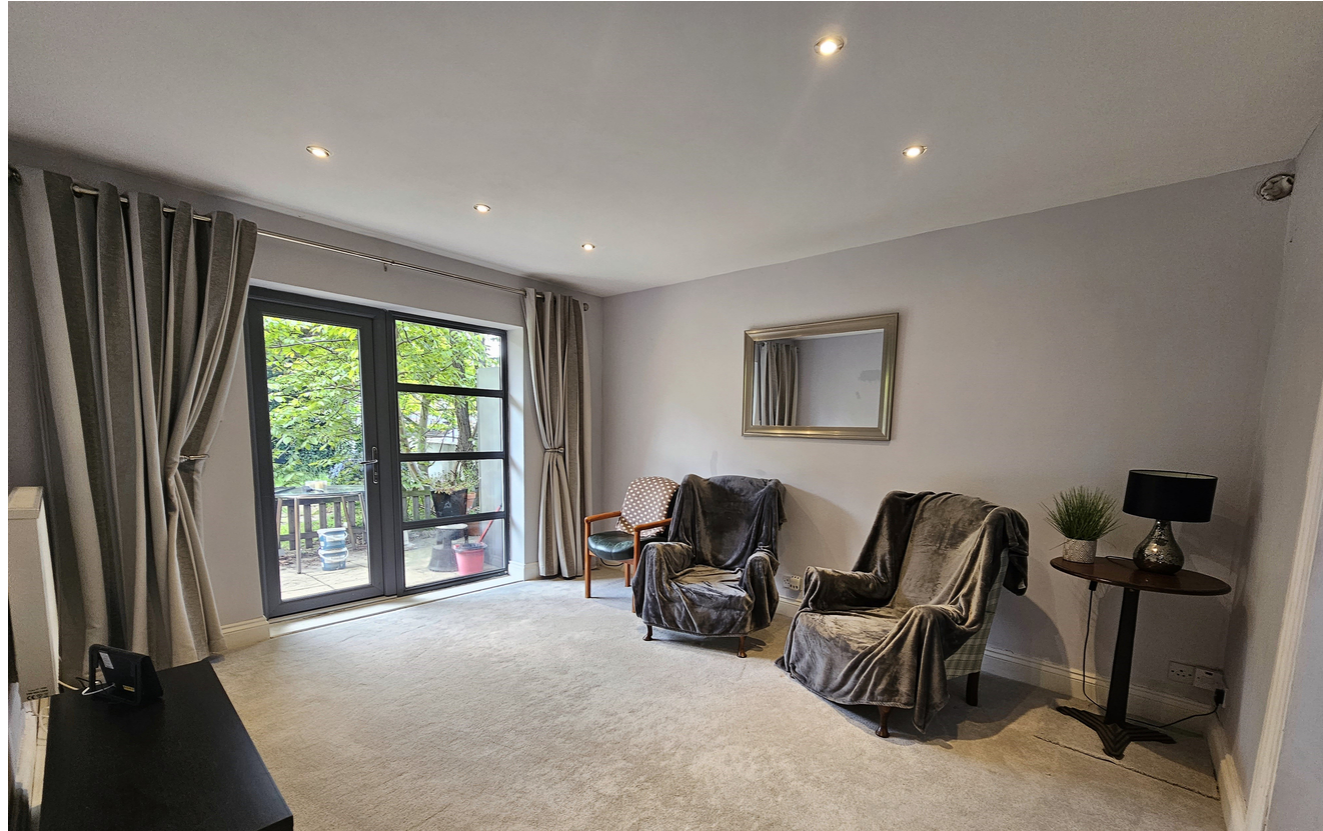
Flat 1, 349 Bay Tree Court, Longbridge Road, Barking, Greater London. IG11 9DH.