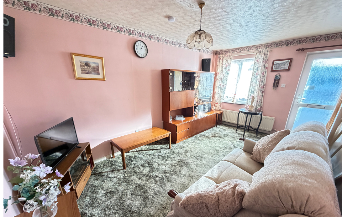
17 Willowmead, Staines-upon-Thames, Surrey TW18 2SH £385,000 - Freehold