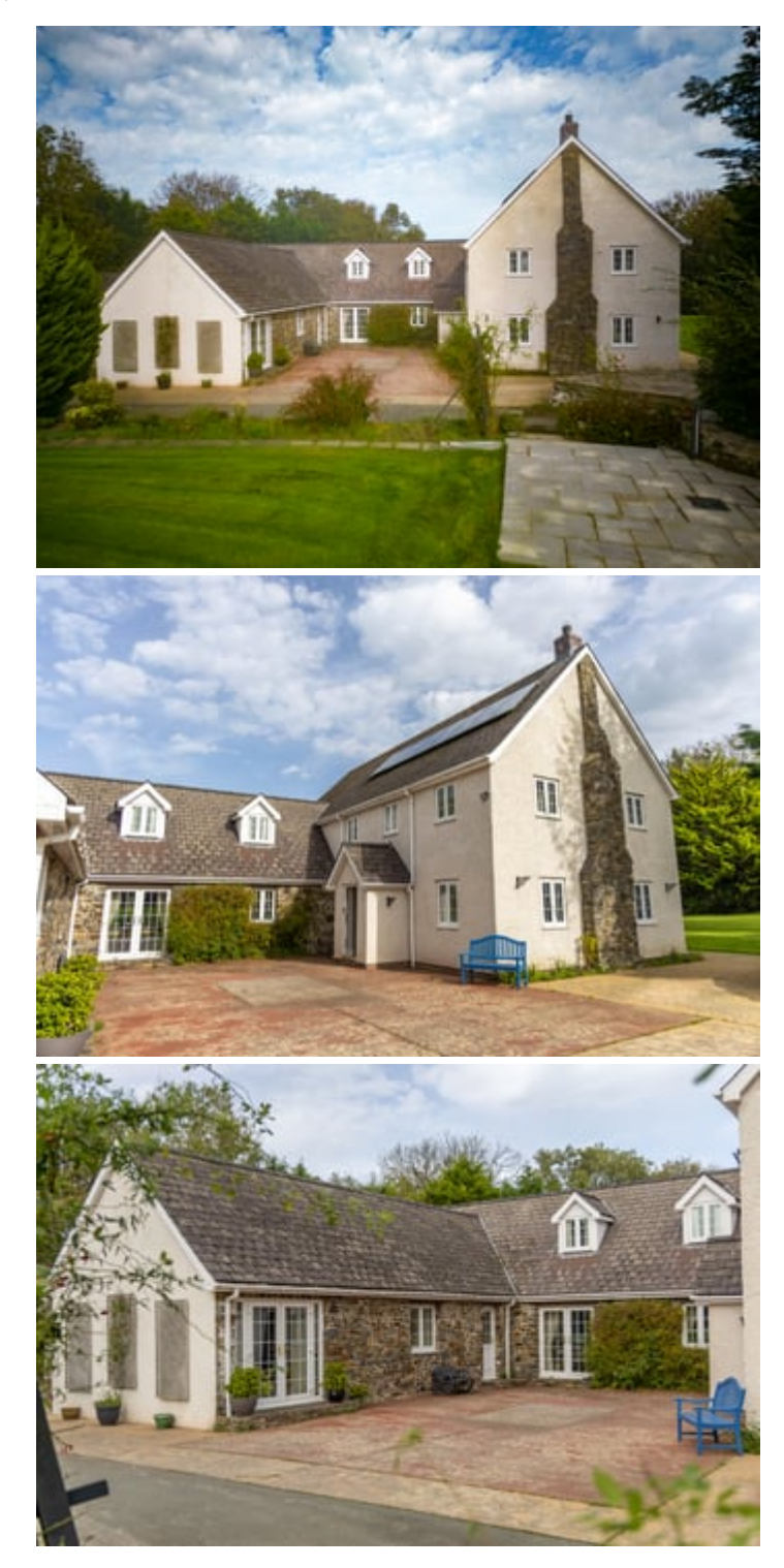
Corner Summer House

9' 5" x 15' 2" (2.87m x 4.62m) being a recent addition, of timber frame construction under a slated roof with panelled exterior walls with bi-fold doors to both sides, wood effect flooring. Overlooking the front garden area.