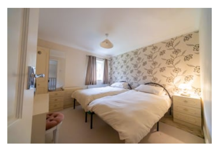
Rear Bedroom 4

10' 9" x 10' 3" (3.28m x 3.12m) a double bedroom, window to side, radiator, multiple sockets.