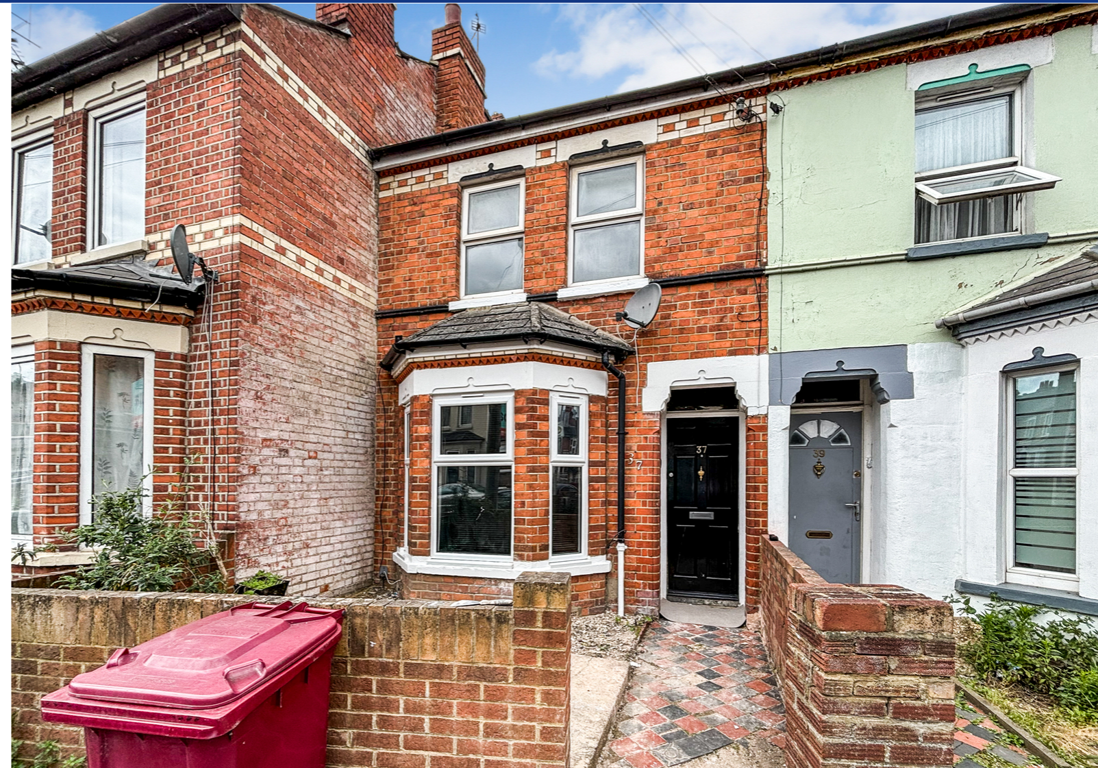
Salisbury Road, Reading, Berkshire.

SALISBURY ROAD TOTAL FLOOR AREA : 419 sq.ft. (38.9 sq.m.) approx. Whilst every attempt has been made to ensure the accuracy of the floorplan contained here, measurements of doors, windows, rooms and any other items are approximate and no responsibility is taken for any error, omission or mis-statement. This plan is for illustrative purposes only and should be used as such by any prospective purchaser. The services, systems and appliances shown have not been tested and no guarantee as to their operability or efficiency can be given. Made with Metropix ©2024