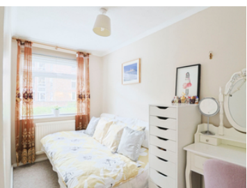
FLAT 27, QUARRY CHASE, 30 POOLE ROAD, WESTBOURNE BH4 9DD £205,000