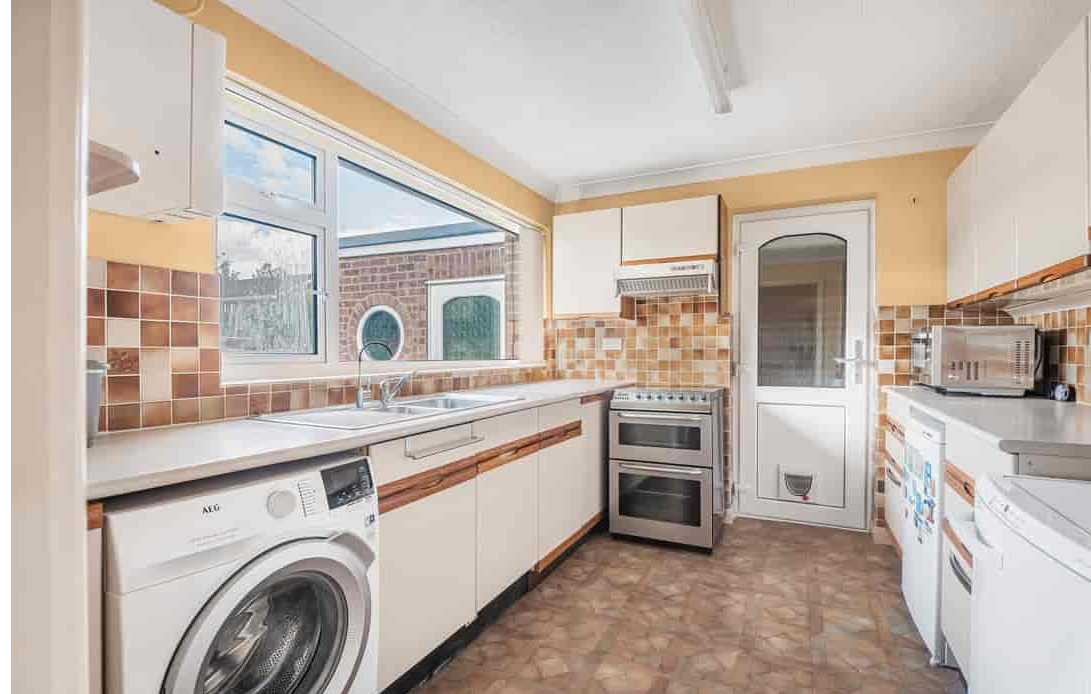
4 Badgebury Rise, Marlow, Buckinghamshire SL7 3QA Guide Price £695,000 - Freehold