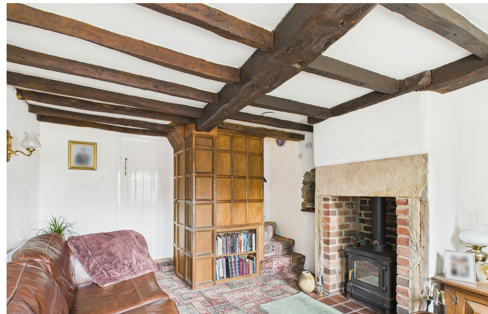
Eaton Bank, Duffield, Belper, Derbyshire DE56 4BH £395,000 - Freehold