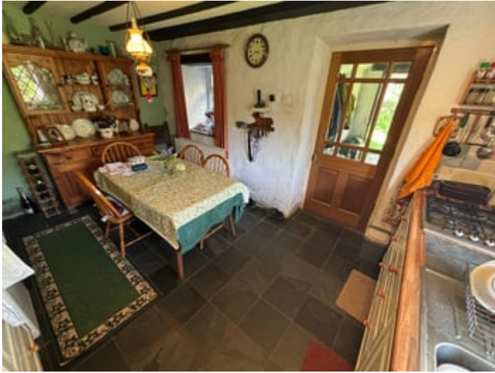
KITCHEN (SECOND IMAGE)

14' 5" x 10' 0" (4.39m x 3.05m). A cottage style fitted kitchen with a range of wall and floor units with work surfaces over, stainless steel 1 1/2 sink and drainer unit, eye level electric oven, 4 ring LPG hob, tiled flooring, radiator.