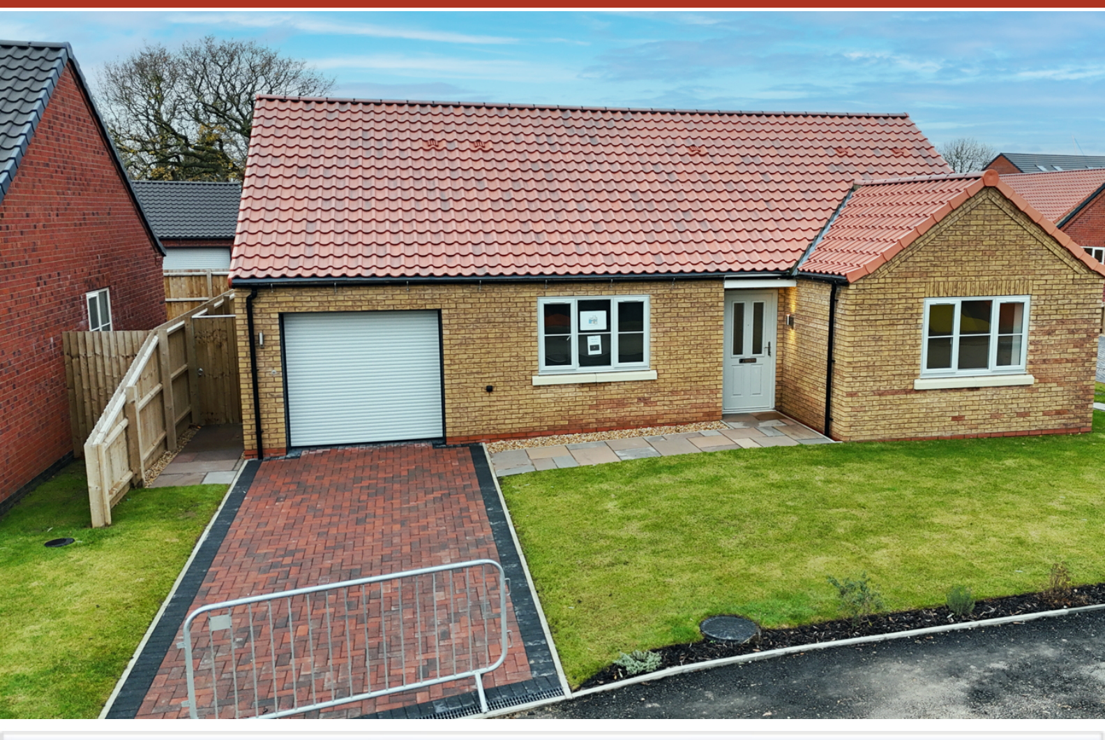
Plot 3 Cedar Close, Quadring, Spalding, Lincolnshire PE11 4GP