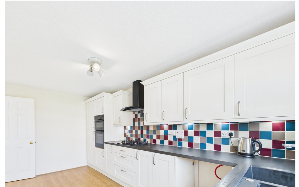
John O'gaunts Way, Belper, Derbyshire DE56 0DT £375,000 - Freehold