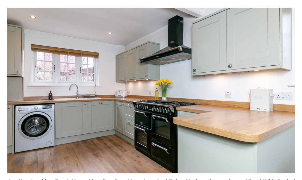
Are You Looking For A Home You Can Just Move Into And Enjoy Modern Convenience Mixed With Period Character? One that won't break the bank? First time buyer? Young family? No Stamp Duty up to £425k. Maybe you are downsizing to a more manageable home without sacrificing on space or style? This property will suit a range of buyers and offers the perfect balance of comfort, convenience, and charm. LOOK NO FURTHER!

This attractive, EARLY GARDEN CITY style THREE bedroom semi detached house sits on a large corner plot with landscaped gardens and driveway close to Letchworth town centre and station.