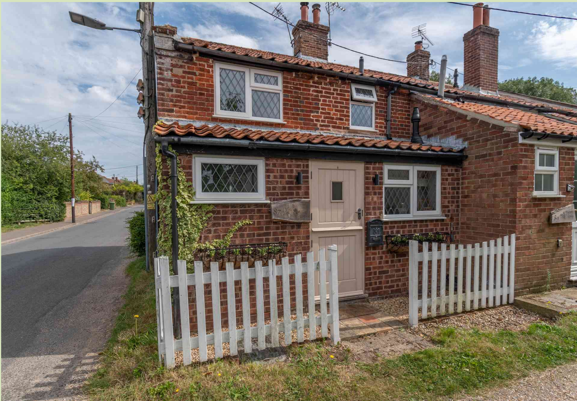
Bay Tree Cottage, Great Ryburgh Offers in Excess of £220,000