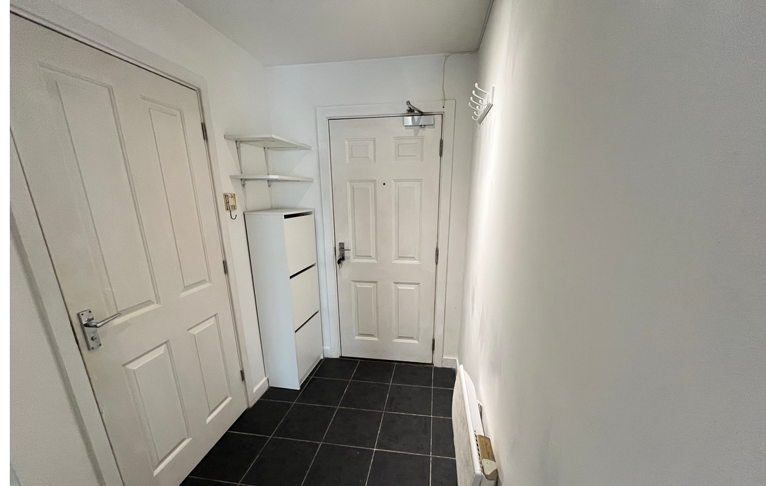
7 Dudley Place, Stanwell, Staines-upon-Thames, Surrey TW19 7BG £219,950 - Leasehold