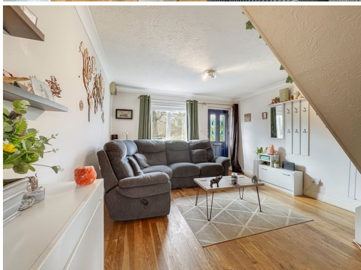
13' 7" x 12' 4" (4.14m x 3.76m)