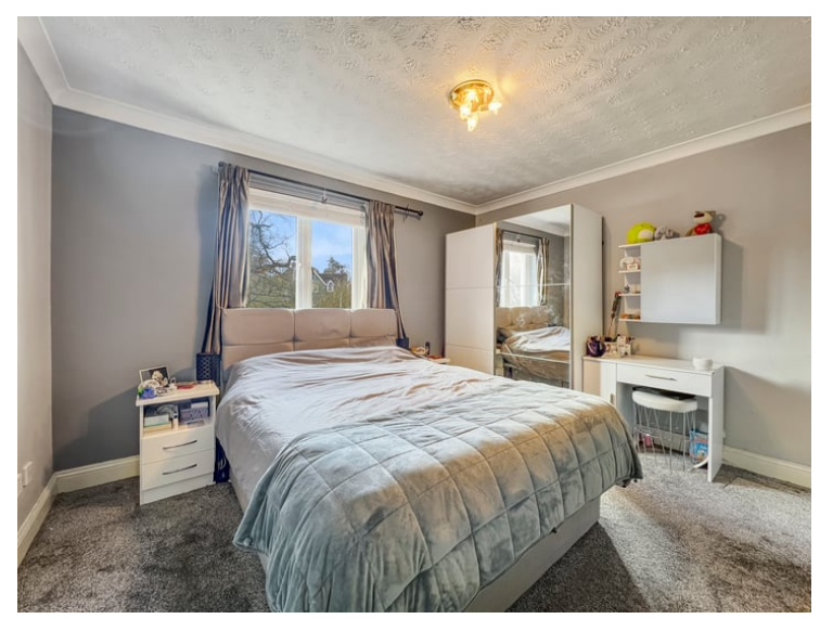
12' 4" x 9' 8" (3.76m x 2.95m)