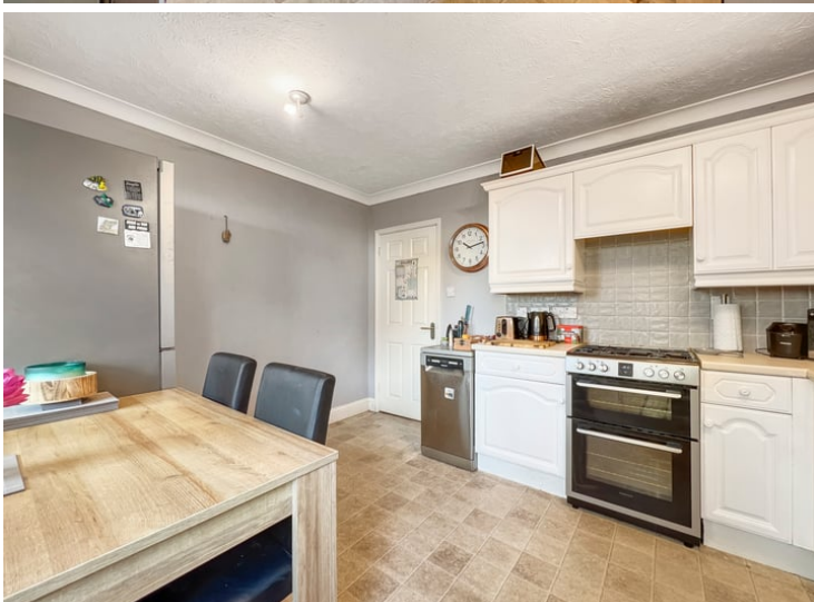
12' 4" x 10' 1" (3.76m x 3.07m)