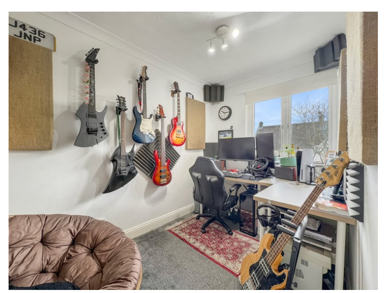
10' 1" x 6' 5" (3.07m x 1.96m)