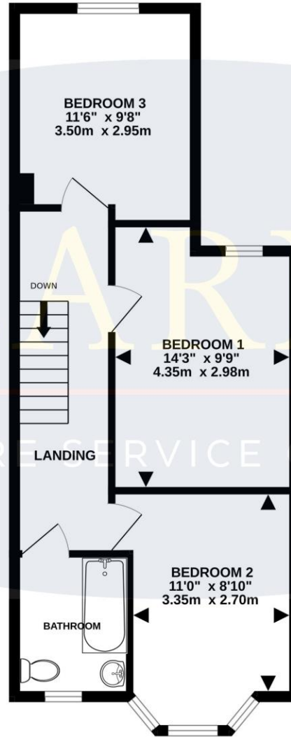
1ST FLOOR 489 sq.ft. (45.4 sq.m.) approx.