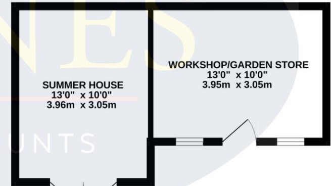
NOT LOCATED IN EXACT POSITION 260 sq.ft. (24.1 sq.m.) approx.