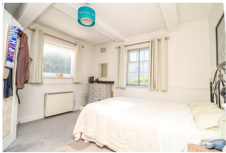
11' 9" x 11' 4" (3.58m x 3.45m) Windows to front and side, electric heater, built in wardrobe, door to: