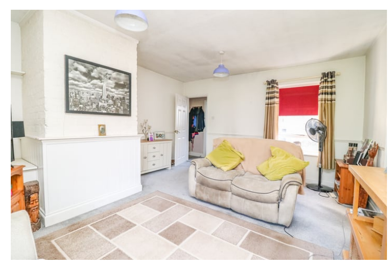
16' 3" x 13' 5" (4.95m x 4.09m) Exposed brick chimney breast, window to front.