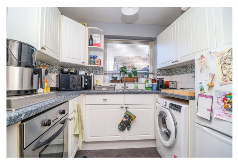
7' 8" x 6' 5" (2.34m x 1.96m) Tiled flooring, range of modern fitted base and eye level units with working surfaces to side and tiled splash backs, built in electric oven and hob with extractor hood above, space for further appliances, inset sink unit, window to rear.