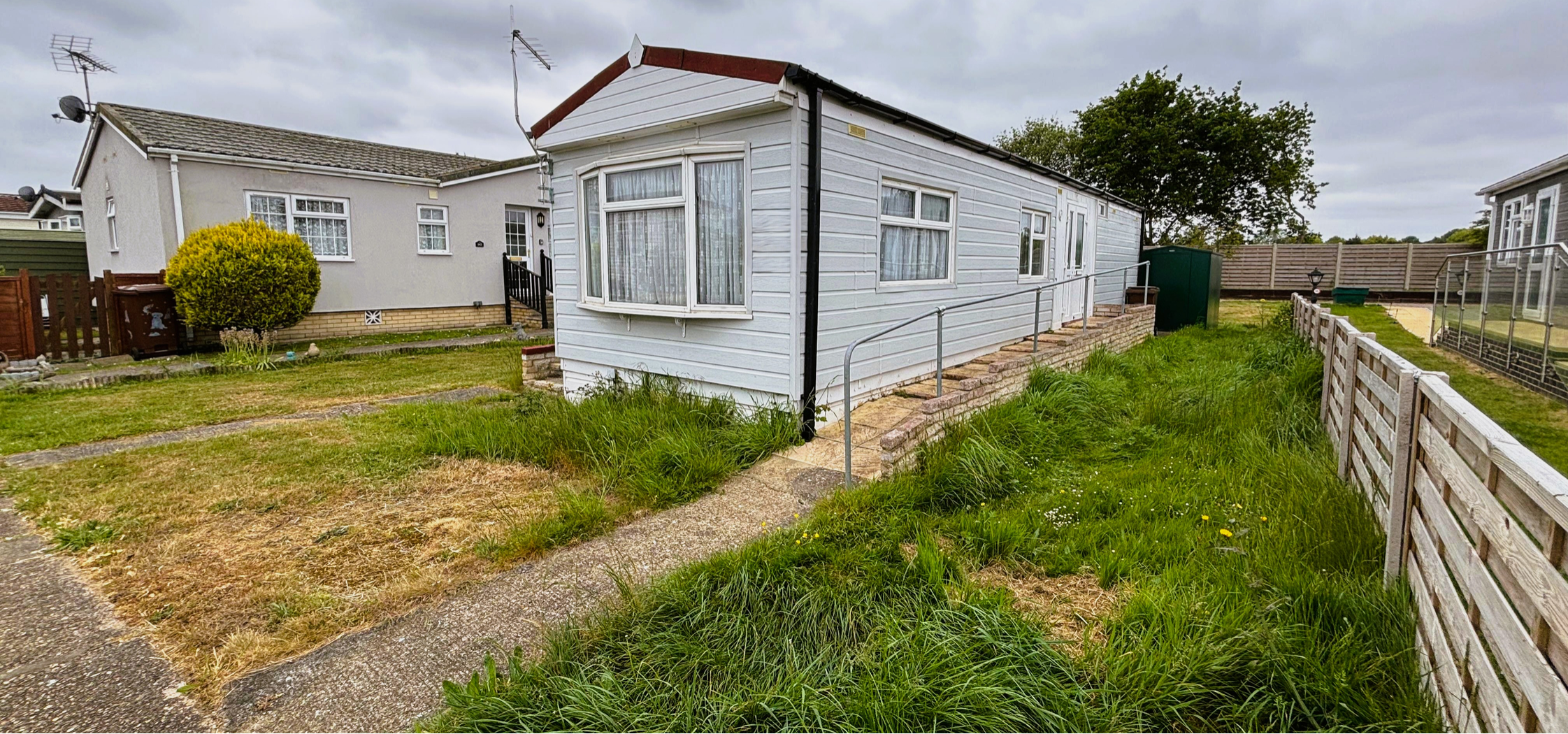
Two Bedroom Park Home Kingsmead Park, Rochester, Kent, ME3 9TA

Offers in Region of £80,000 Non-traditional